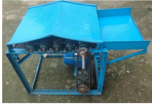
Figure 4. Pictorial view of the model-1 of power sunflower thresher