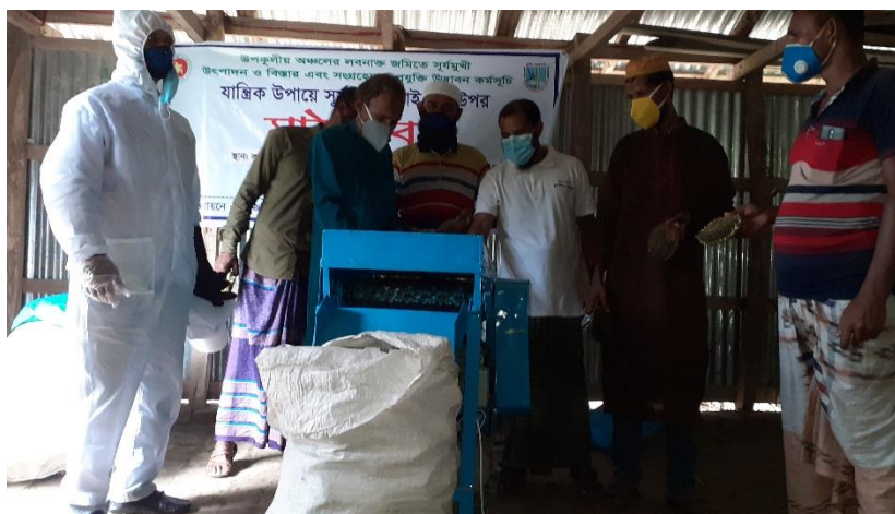
Figure 6. Field use of the sunflower thresher in Patuakhali

the scientists of OFRD, Patuakhali (Figure 6) and used by the farmers. The capacity of the sunflower thresher was 100 kg/h, which was similar to the capacity observed in the laboratory. Detailed performance data could not be collected due to transportation constraints caused by COVID19.