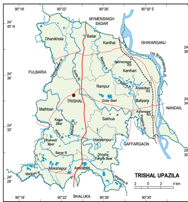
Fig. 3. Map of Trishal upazila showing study area

The formula was considered for positive statements, on the other hand scoring was reverse for negative statements. In case of negative statements strongly agree, agree, undecided, disagree and strongly disagree were assigned weight as 0, 1, 2, 3 and 4 respectively. Thus, the attitude score of a respondent could range from 0 to 76; while 0 indicating highly unfavourable attitude and 76 indicating highly favourable attitude towards NATP (phase-I) interventions. The collected data were properly edited and coded before final analysis. All inconsistent data was avoided to element the errors and fault. The Statistical Package for Social Sciences (SPSS) was used for the data management. Mainly descriptive statistical techniques such as percentage, frequency, mean, standard deviation and correlation analyses were done to measure the relationship between the selected characteristics of CIG members and their attitude towards NATP (phase-I) interventions.