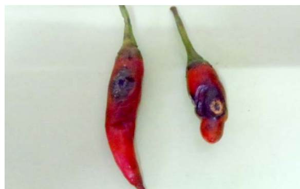
Photo 2. Typical Symptoms of Cercospora leaf spot of Chilli fruit