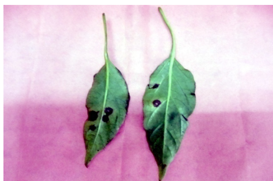
Photo 1. Typical Symptoms of Cercospora leaf spot of Chilli leaves

Symptoms: Dark brown spots with ashy centre were observed on the leaf surface (Photo 1). On fruits, the lesions were deep brown enlarged mainly on ripening fruits (Photo 2). The fungus formed brown mycelial growth on PDA (Photo 3). Under microscope, cells structures of Cercospora capsici were observed (Photo 4).