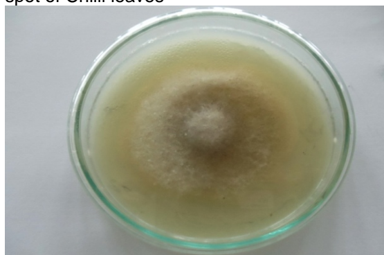
Photo 3. Five days old culture of Cercospora capsici grown on PDA media.