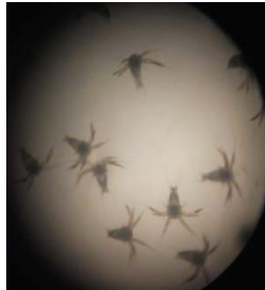
Fig 5. Newly hatched nauplii of P. monodon