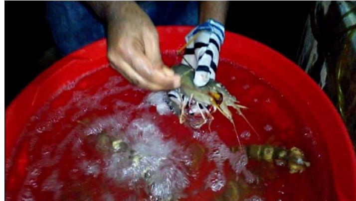
Fig. 3. Addition of 1% Povidone iodine near the ablated area.