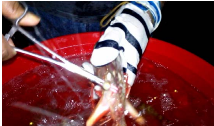
Fig. 2. Unilateral eye stalk ablation of P. monodon at the investigated hatchery